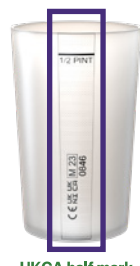
UKCA half mark