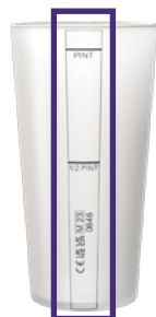
UKCA pint and half marks